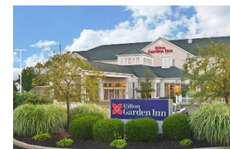
Hilton Garden Inn