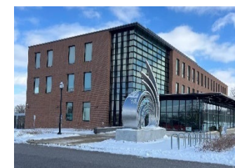
Wooster Science Building